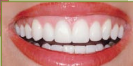
orthodontics & veneers