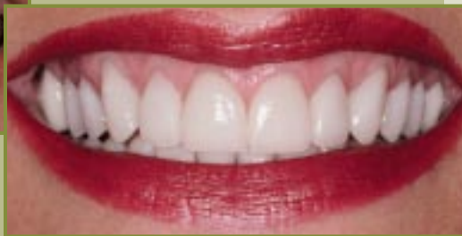
gum sculpting & veneers