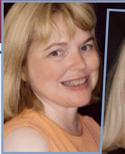
Dare to turn heads with a smile that's been radiantly rejuvenated!

Make your zest for the best work for you. Live life to the fullest ... and smile, smile, smile!